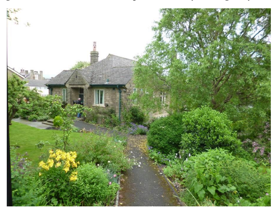
Fig.3: meeting house and garden viewed from the south-west

The meeting house is on the north side of Keighley town centre, set on a plot below the east side of the busy Skipton Road, at the junction with Strawberry Street which slopes steeply to the east. The area is residential with large nineteenth century villas and terraces set in leafy gardens on Skipton Road, and late twentieth century housing to the east of the meeting house. The high retaining wall along the east side Skipton Road is stone with weathered copings, with a small pedestrian entrance on the street corner. The meeting house stands in an attractive garden with trees and shrubs; Open Garden days are regularly held.