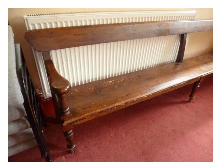
Fig.2: one of three pine benches